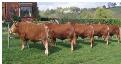
(A line up of yearlings from the SAS Group sired by linkage bulls)

SAS Group was set up 9 years ago by 8 South Devon breeders with small herds. The aim is to make greater genetic improvement by working together than was possible in isolation.